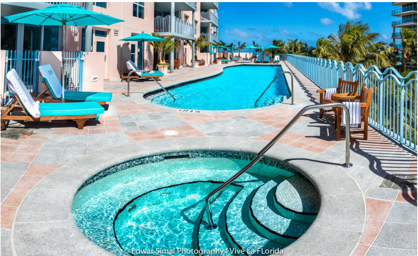
© Edwar Simal Photography | Vive La Florida